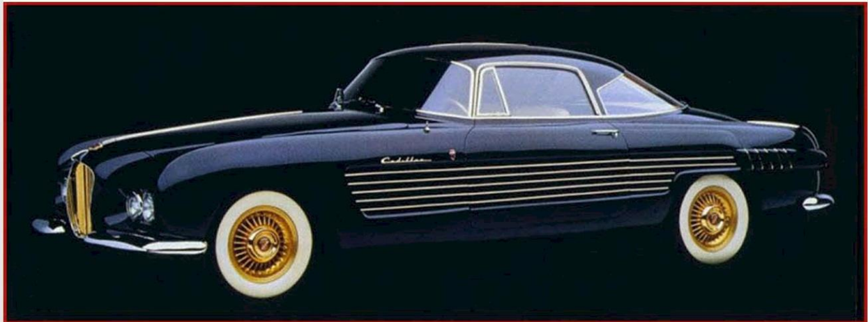
1953 CADILLAC GHIA COUPE