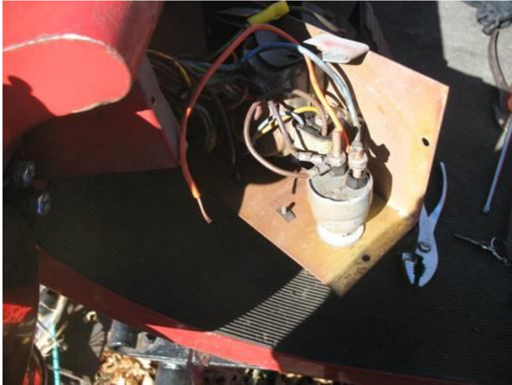
Roger's wiring restoration in-process. Those look like no. 10 wires!