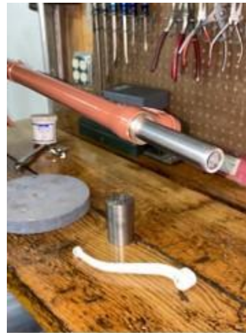
1Hollow steel rod inserted

I then designed two pieces of flat stock. The one on the left mounts to the end of the transmission control rod and the T-shaped piece pivots at hole "P" pulling the bands tight from holes "F" and "R" when it is rotated by a rod between the control and the plate. (see below)