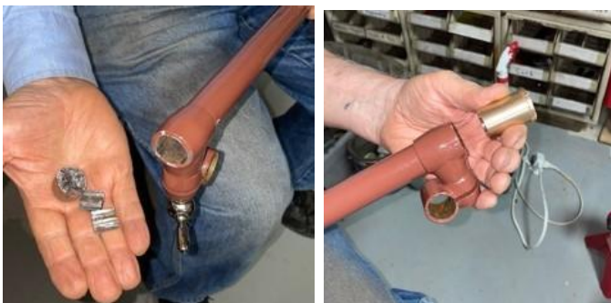
Plugs removed (left) and bronze bushings installed (right)

I cut the plugs out of each end of the steering column. I installed a bronze bushing, and put a hollow steel rod inside the column to function as the control rod for the drums. I then designed two pieces of flat stock. The one on the left mounts to the end of the transmission control rod and the T-shaped piece pivots at hold "P" pulling the bands tight from holes "F" and "R" when it is rotated by a rod between the control and the plate. (See series of photos below)