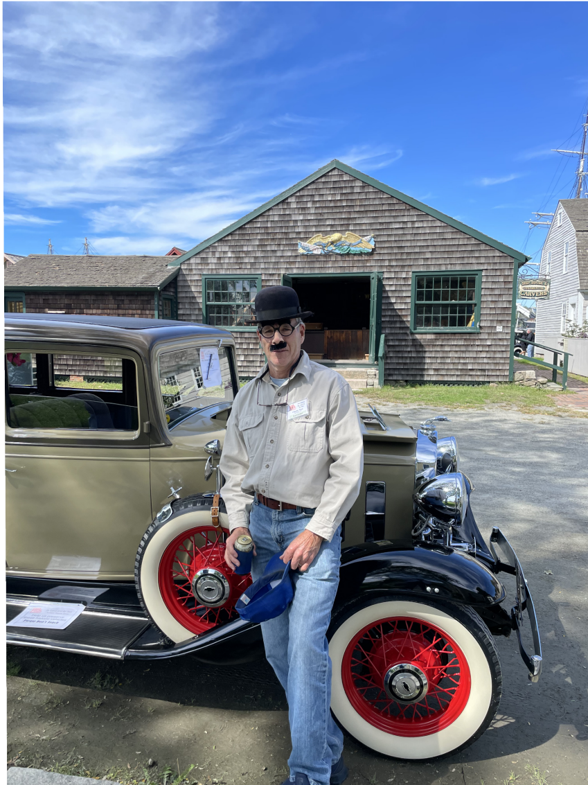
This is the proper outfit for the owner of a 1932 Chevrolet